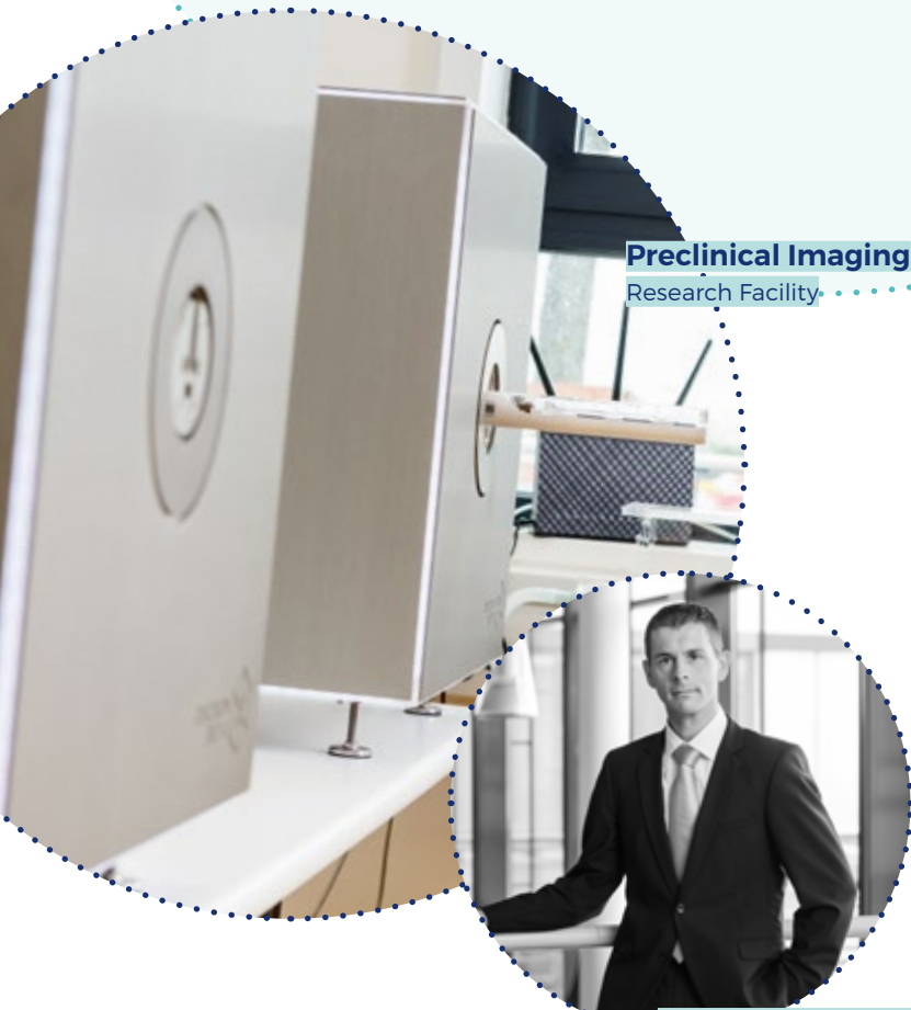
Preclinical Imaging Research Facility